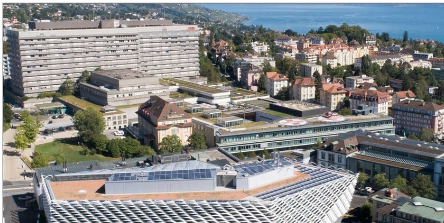
TRANSLATIONAL RESEARCH ECOSYSTEM